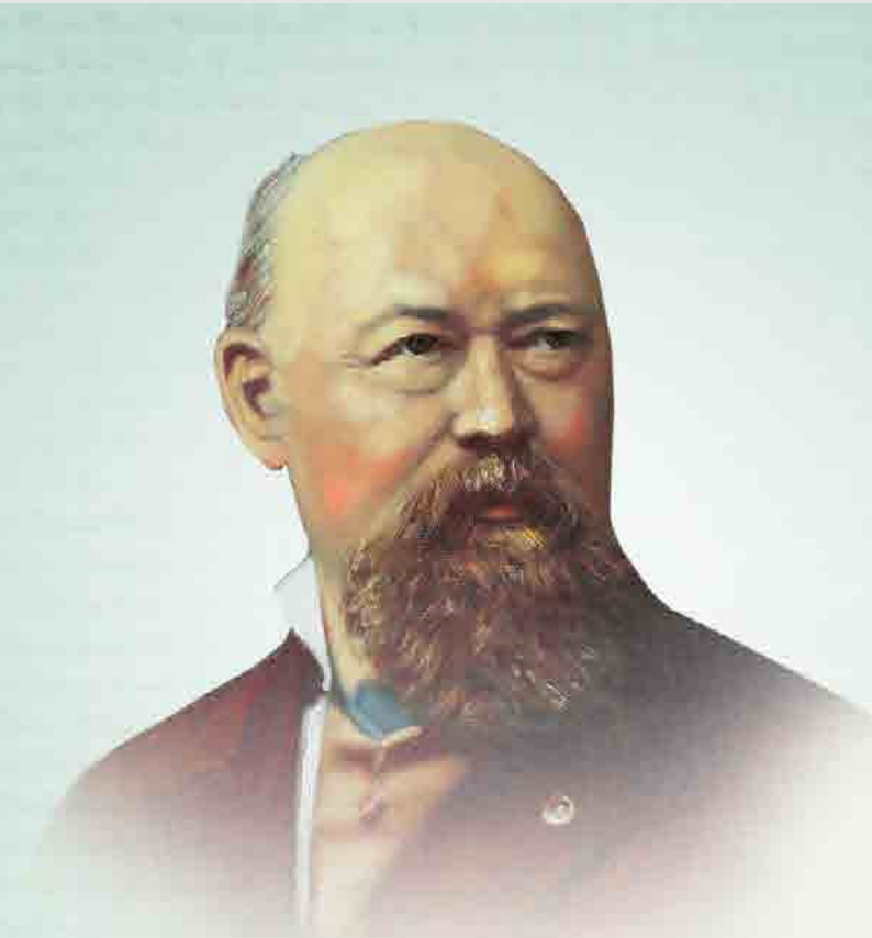
Franz von Suppé