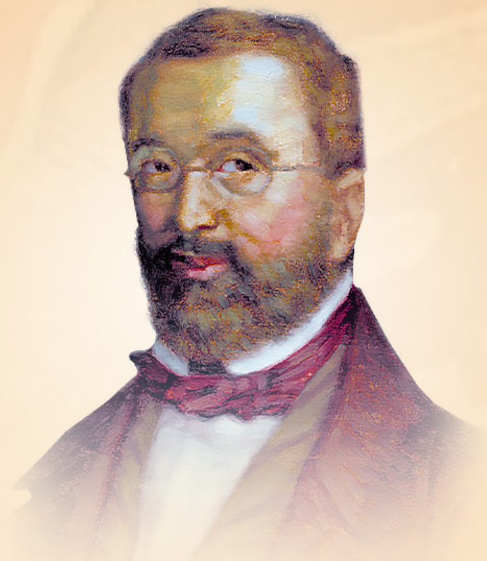
Adolphe Adam

Playing Time: 88:57 Release Date: 26 May 2023